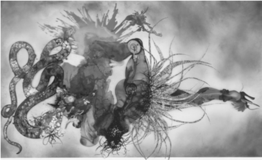
Wangechi Mutu, Non je ne regrette rien , mixed media on Mylar, 138.4 x 233.7 cm, 2007.

The incorporation of various modes of technology and mechanical parts as proxies for human limbs situates Mutu's work within a posthumanist discourse of the cyborg. In "A Cyborg Manifesto," Haraway writes, "A